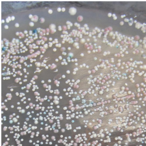
Figure 1: Growth of Mixed colonies

Sensitivity and Specificity on Hicrome agar of each species is represented in Fig 2. No batch- batch variation seen, as tested by C. albicans ATCC 90028.