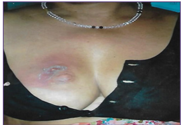
Fig. 1: Clinical image showing breast swelling with overlying erythematous skin.

was performed by using 23 gauge needle & 10 ml syringe under aseptic conditions. Aspirate yielded pus, air-dried and wet-fixed smears were prepared. Smears were stained with Giemsa and Ziehl-Neelsen (Z-N) Stain for acid-fast bacilli. The smears revealed microfilaria surrounded by dense inflammatory cell-infiltrate comprising of neutrophil, eosinophil, lymphocyte, etc. The microfilaria was identified as those of Wuchereria bancrofti by the presence of a hyaline sheath, the length of the cephalic space, and the presence of somatic cells (nuclei). The somatic cells appeared as granules that extended from the head to the tail, the tail tip was free of nuclei (Fig 1 & 2). A diagnosis of Filarial abscess of breast was made. Z-N stain smears revealed no Acid-fast bacilli. Subsequently, night samples of peripheral blood smear were obtained which was negative for microfilaria. The patient received combination therapy of diethyl carbamazine citrate (DEC), amoxicillin clavulanic acid, albendazole and responded well.