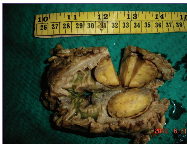
Fig. 1: Gross morphology (case 1), showing well circumscribed intraluminal mass.

Grossly, both cases showed presence of very well circumscribed, round, 4x5 cm [figure1] and 4x4.5cm, soft, homogeneous mass obstructing the whole of the colonic lumen. Surrounding mucosal tissue did not reveal any significant macroscopic pathology. On histopathological examination, both cases were diagnosed as submucosal lipoma [figure 2] consisting of well differentiated adipose tissue with fibrous capsule. Surrounding colonic tissue showed mucosal glandular hyperplasia, but no evidence of malignancy was noted in both the cases. Both the cases had uneventful post-operative recovery and patients are doing well on follow-up.