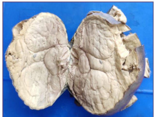
Fig. 2: After fixation:The tumour appears lobulated and homogenous.