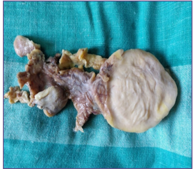
Fig. 2: Gross showed a well encapsulated nodular soft tissue mass measuring 8x7.5x 2.3 cm. Cut section showed soft to firm grey white to yellowish areas.