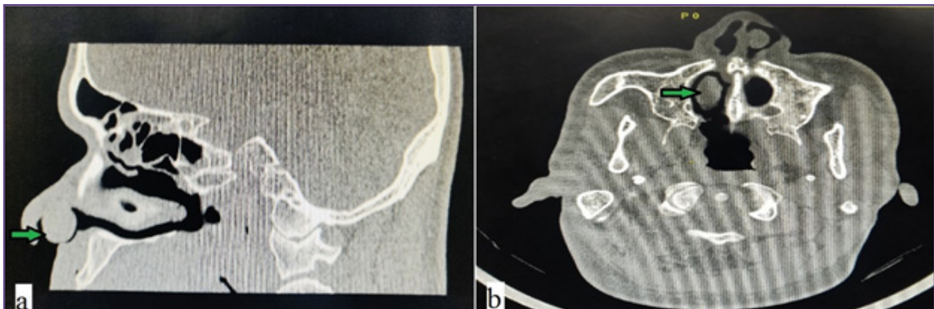
Fig. 1: (a) Sagittal NCCT image shows a mass (green arrow) in the left nasal cavity; (b) Axial NCCT image shows a homogeneous mass (green arrow) in the left nasal vestibule arising from nasal septum.

Leiomyomas are benign mesenchymal neoplasm derived from smooth muscle. They are common in uterus, cervix, ovary, gastrointestinal tract and skin but uncommon in respiratory tract; rarely found in the nose and paranasal sinuses where they constitute only 1% of all the benign lesions. [1] On extensive literature search, very few cases of nasal leiomyomas have been reported till date. [2-4] Enzinger and Weiss in their study of 7748 cases of Leiomyomas, found majority (95%) of them in female genital tract, skin (3%), GIT (1.5%) and the remaining in rare sites like nasal cavity and PNS (0.5%). [5] The rarity of its occurrence in respiratory tract is supposed to the fact that smooth muscle is only present in the wall of blood vessels and sparsely present in the nose. The possible differential diagnosis of mesenchymal tumors occurring in nasal cavity is neurofibroma, schwannoma, angiofibroma, hemangioma and leiomyosarcoma. Immunohistochemical markers like smooth muscle actin (SMA), Desmin, S-100, Vimentin and CD34 can be used to differentiate these tumors. Tumor size, histopathological features like mitotic activity, cellular atypia, infiltrating margins and