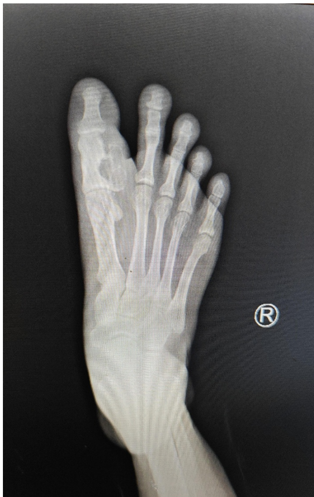
Figure 2: X-ray right leg AP view.