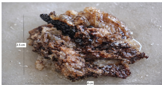
Figure 3: Multiple grey-brown to tan, soft to firm tissue pieces measuring 4x2.5x1 cm showing congestion and few cystic areas.

Giant cell tumor, one of the differential diagnoses, is a neoplastic, locally aggressive tumor that commonly affects the third to fifth decade of life. Radiographically, these lesions are purely lytic and located eccentrically in the epiphyses of long bones, affecting the subchondral bone along with frequent cortical expansion or interruption. On histopathological examination, these lesions have mononuclear cells, macrophages, and uniformly distributed multinuclear giant cells.[3, 5]