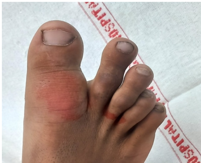
Figure 1: Swelling of 4x2 cm at medial aspect of proximal phalanx of right great toe.

A 20-year male came to OPD with chief complaint of pain in right great toe since 5 months. On examination, a cystic lesion was identified in proximal phalanx of right great toe (Fig. 1).