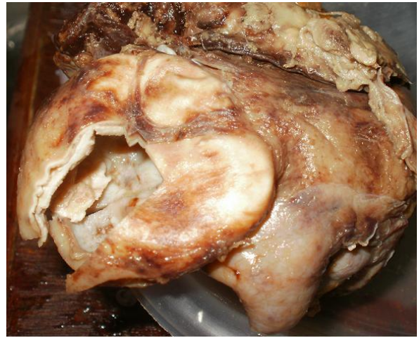
Figure 1: Outer surface with cystic cavity with absence of grossly identified stones

A 52 year old female patient presented with complains of burning micturition, nausea, vomiting and fever for 15 days at tertiary care hospital, Rajkot. Patient has left pleural effusion, exudative in nature without malignant cells. ECG shows sinus tachycardia with inverted T wave. However 2D Echocardiography study has been normal with no history of urinary tract stones and trauma. Laboratory values revealed elevated White blood cell count (19,200/cumm) with 87% of neutrophils and elevated serum creatinine (1.92mg/dL). In this case ultrasonography examination reveals hydronephrotic changes with absence of obstruction, stone and fibrosis. Pelvi-ureteric junction was normal. Ureter does not show any remarkable changes. Intravenous pyelogram shows hydronephrosis with nonfunctioning of left kidney, so nephrectomy was done as suspicious of stag horn stone. Gross examination of nephrectomy specimen revealed that the kidney was enlarged, distorted and measured 9.5 x 7.0 x 5.0 cm, with perinephric fat and capsule adherent on surface. On cut section of nephrectomy specimen showed most of the renal parenchyma replaced by multiloculated cystic area. At places cystic cavity contain firm cheesy like whitish, friable material and absence of grossly identified stones (figure1).