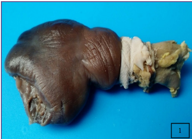
Fig. 1: Gross examination of the external aspect of umbilical cord (fetal insertion) which shows dilated and hemorrhagic outer surface.

and focal hemorrhage (Fig. 2 and 3). The rest of the post mortem examination revealed only generalized vascular congestion. No other abnormalities were found.