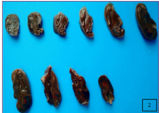
Fig. 2: Serial sections of the cord showing progressive dilatation of the umbilical vein (left to right, top to bottom) with progressive thinning of surrounding Wharton Jelly with ulceration and associated cord hematoma.