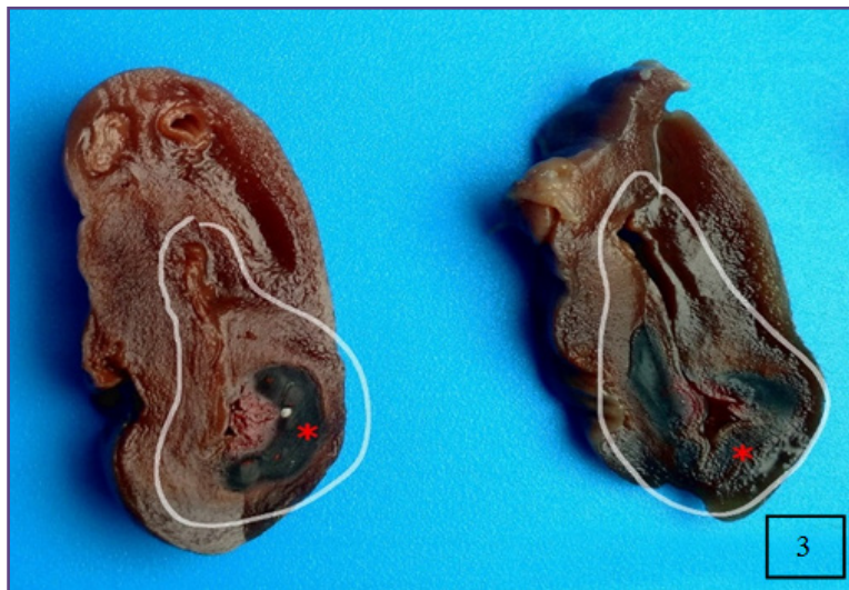
Fig. 3: Two cord sections (close-up) showing in detail the umbilical vein dilatation and cord hematoma(*).