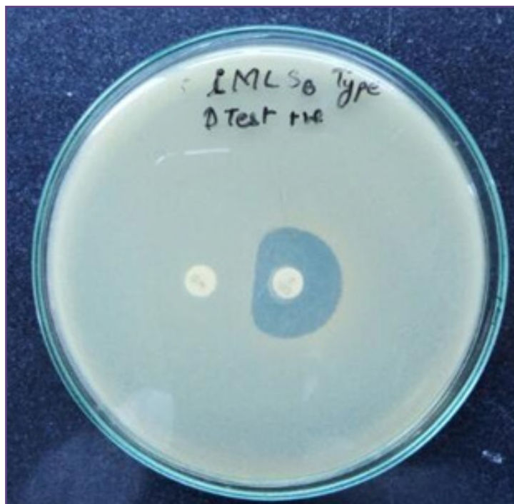
Fig. 1: The D- test showing positive result.

Test of phenotype proportion : chi sq = 15.20, p<0.001