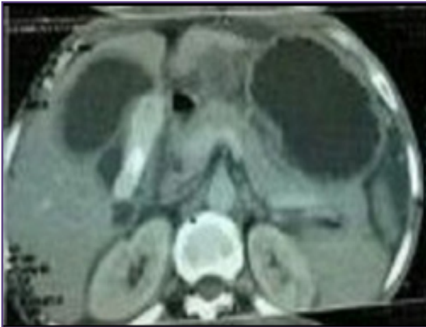
Fig. 1: CT abdomen showing distended sludge filled gall bladder with a calculus of 3.5cm diameter.