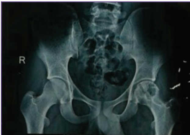
Fig. 1: Plain radiograph showing lytic lesion over neck and head of left femur

An 18 year old male patient presented with complaints of pain over left hip for the past one year which increased on walking and weight bearing. Clinically there was tenderness over left hip. X- Ray revealed an osteolytic lesion over neck and head of femur (fig.1).