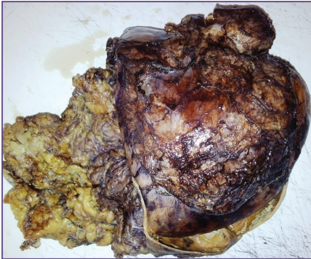
Fig. 1: Gross Specimen of Abdominal Lump

surgical removal. The second type is aseptic with fibrotic reaction to the cotton material and development of mass. This response usually presents with mass or abdominal pain or more commonly is an incidental finding. [3] This case is peculiar as it has presented seven years after surgery and had elevated levels of CA 125 thus mimicking an ovarian tumor.