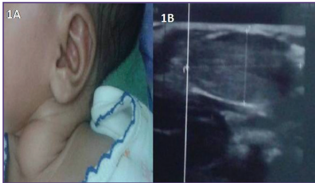
Fig. 1: 1a: Neonate presenting as left sided neck swelling. 1b: USG showing fusiform enlargement of SCM muscle.