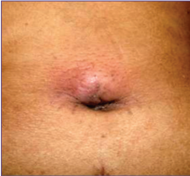
Fig. 3: Clinical picture of the metastatic peri-umbilical nodule.

metastasis may evolve through three possible mechanisms including direct spread, local spread and distant spread [6]. Direct extension is due to contiguous spread via tissue planes. Local spread can be ascribed to spread through dermal lymphatics with resultant implantation in the skin. Distant metastasis is the result of hematogenous spread. This route of hematogenous spread could be either through pulmonary circulation or bypassing pulmonary circulation via azygous and vertebral venous plexus [7].