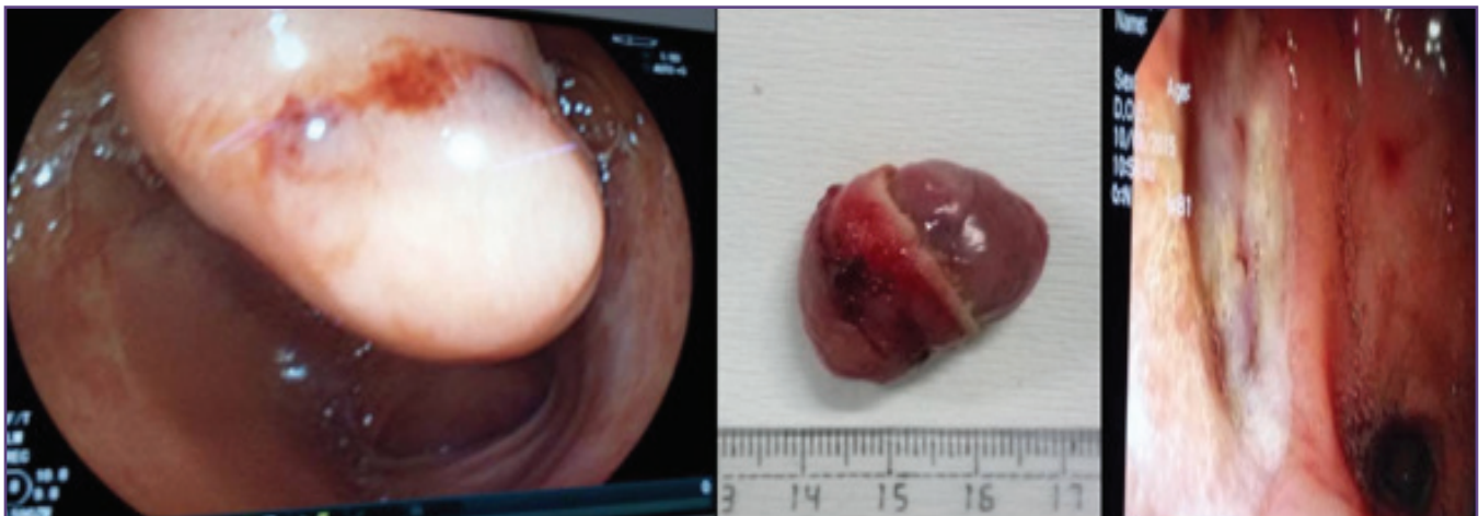
Fig. 1: Endoscopic photomicrographs of case 1. a: showing a polyp with focal surface ulceration, b: Gross image of polyp measuring 3 cm, c: post-operative day 3 image showing healing ulcer with clean base.

Pathological Findings: Both the specimens showed a similar histomorphology. Grossly, both the polyps were large, smooth surfaced with focal ulceration and congestion (Figure 1b). No stalks were identified in both the specimens. On microscopy, a polypoidal structure comprising of innumerable proliferating benign Brunner's gland (BG) separated by thick fibrocollagenous and fibromuscular septae and focal ulceration of the overlying mucosa was seen (Figure 3a). At places the septae showed adipose tissue, smooth muscle bundles and infiltration by aggregates of mature lymphocytes (Figure 3c). Focal gastric foveolar metaplasia was seen (Figure 3b). Helicobacter pylori infection was not detected in Giemsa stain. The BGs were diffusely and uniformly positive for MUC1 (Thermo-scientific), while few draining ducts and focal overlying surface epithelium with gastric foveolar metaplasia were MUC5AC (Neomarkers) positive (Figure 3d).